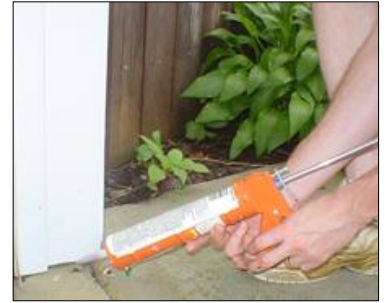
Seal holes on exterior of your house.