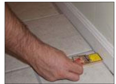
Place snap traps inside your home.

Rat burrows: Most rats live in nests or burrows. Burrows are holes in dirt, wood or concrete that range from 1-inch to 4-inches wide. Rodents cannot be eliminated by blocking their burrows, they will dig another burrow.