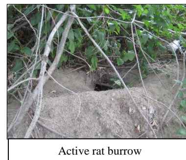
Active rat burrow

It is recommended that you avoid all contact with rodents, rodents droppings, and urine as these can be sources of diseases.